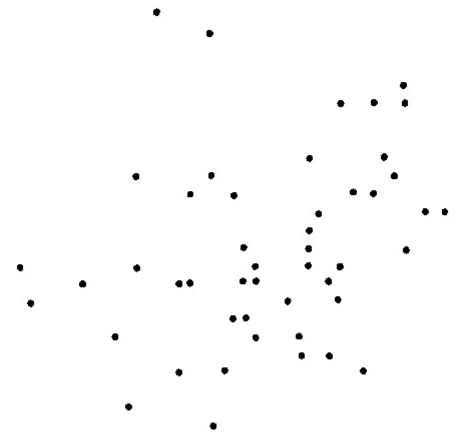
(b) Correlation r = 0.28